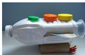
Make something new using recycling materials