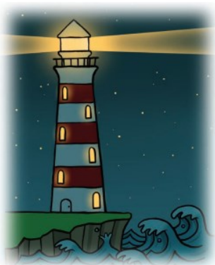
a light in the night

Open your mouth in a relaxed way and say igh igh igh