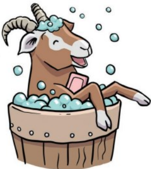
soap that goat

Make an 'o' with your mouth and say oa oa oa