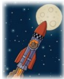
zoom to the moon

This week's sounds are: oo (as in moon), oo (as in book), ar (as in dark) and or (as in horn)