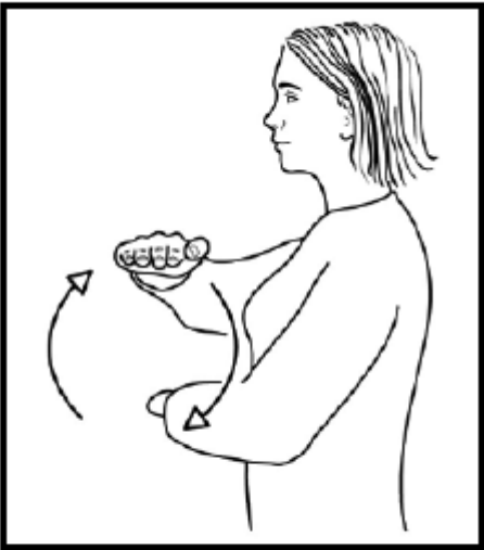
Diagrams, text and descriptions © SIGNALONG

Flat hands (palms down, pointing in) working hand above, make alternate slow backward circles.